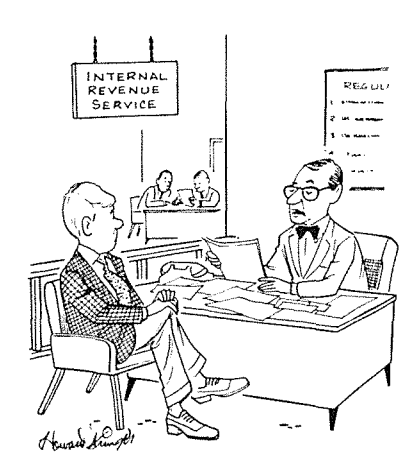
"Yes, I've heard the old saying that you can't get blood out of a turnip. However, the IRS disagrees with that."

So goes one story. There are many others. Still, the April Fool custom is celebrated in a number of countries. In India, where it has been observed for centuries, it is connected with the celebration of the rites of spring on March 31. On that day the people of India are sent on foolish errands. In England, April Fool pranks began in the 18th century. American colonists from England brought the practice with them when they settled here (perhaps that was the most foolish import of all).